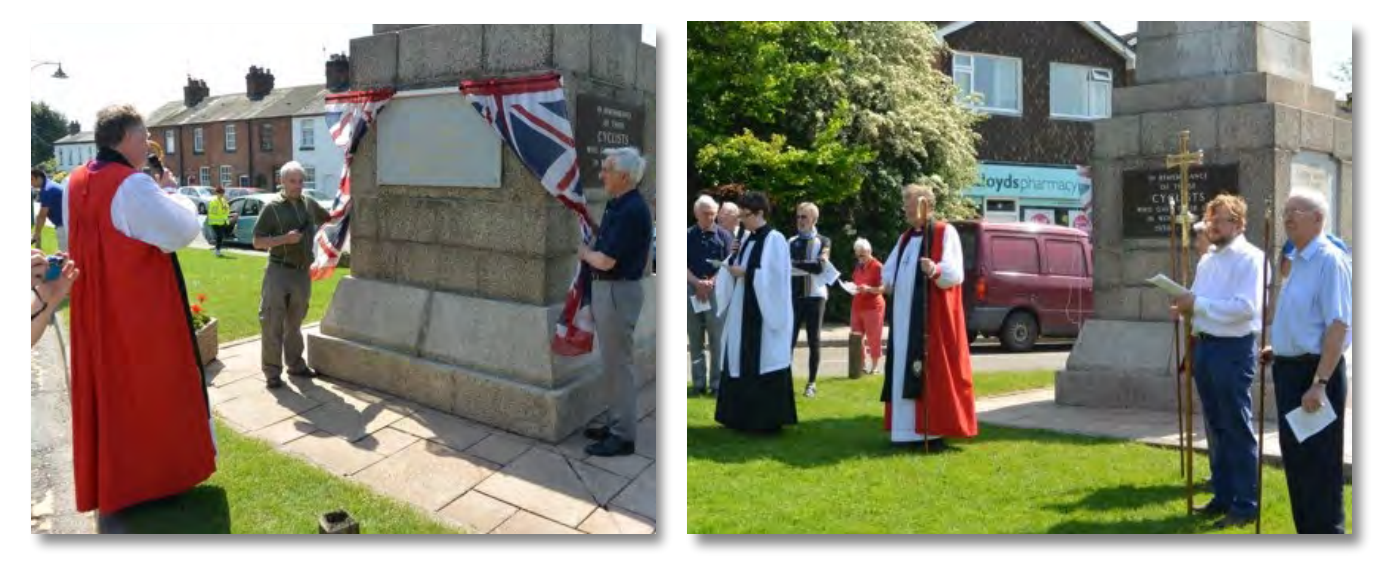
18 May 2014: Dedication by the Bishop of Warwick of the new plaque 'In memory of all cyclists who fought and died for their Country'