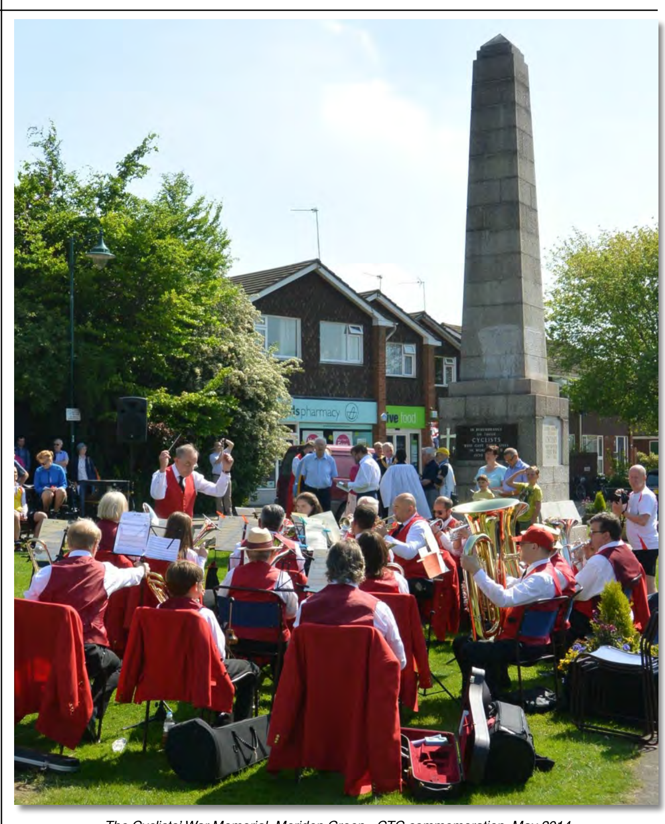
The Cyclists' War Memorial, Meriden Green - CTC commemoration, May 2014