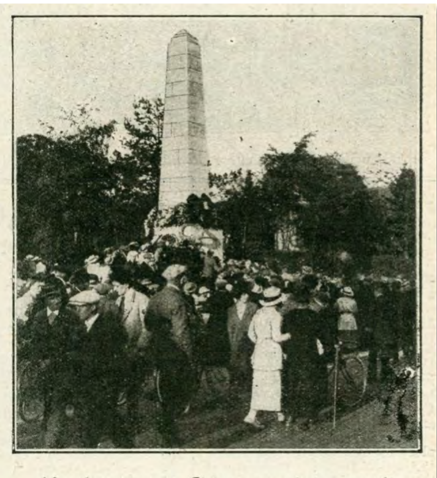
After the ceremony: Clubmen are placing wreaths on the shrine.

The Club recorded the weekend in the Circular . The main party made an all-night ride of it, cycling from Liverpool under a full moon and stars. They breakfasted in Stafford before riding to Crackley, near Kenilworth, the home of fellow member 'Jack' Siddeley, a strong racing cyclist in the