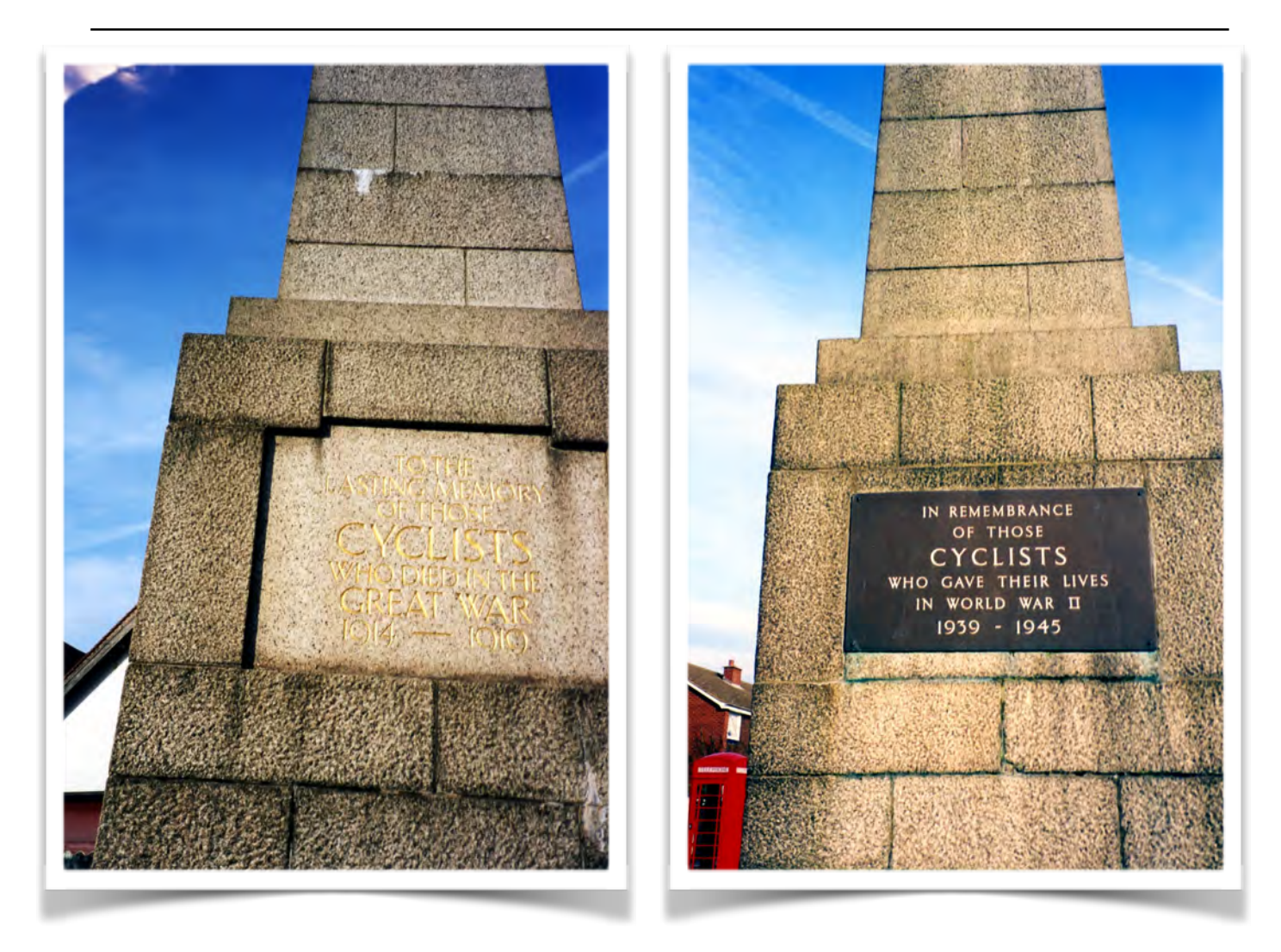
Original dedication and World War II plaque