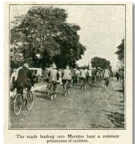
The roads leading into Meriden bore a constant procession of cyclists.

They seemed to come from everywhere in England, as their badges testified. The Anfielders made a straight journey from Liverpool, a party of 38 strong, and among the London clubs who rode through in the day were the North Road, Bath Road, Century, and Kingsdale, while the CTC had strong