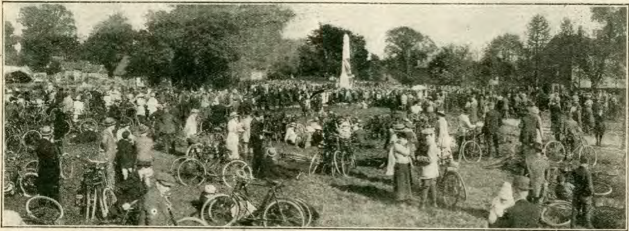
Long before the unveiling, Meriden Green was thronged with cyclists. In the background the Memorial is seen.

'It is the Anfield that has assured the Memorial on Meriden Green, and to us it will represent our four members who made the Supreme Sacrifice.'