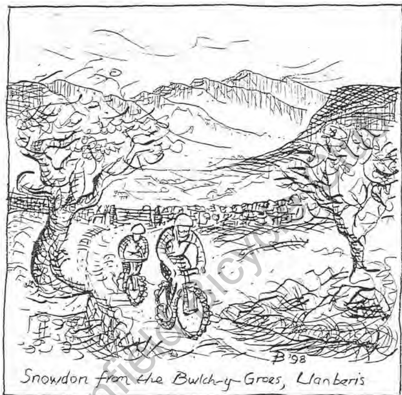
Snowdon from the Bulch-y-Groes, Llanberis