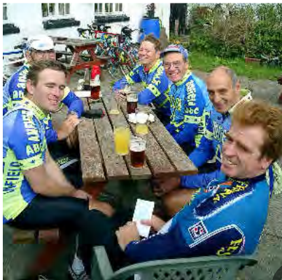
So where are the racing-men?