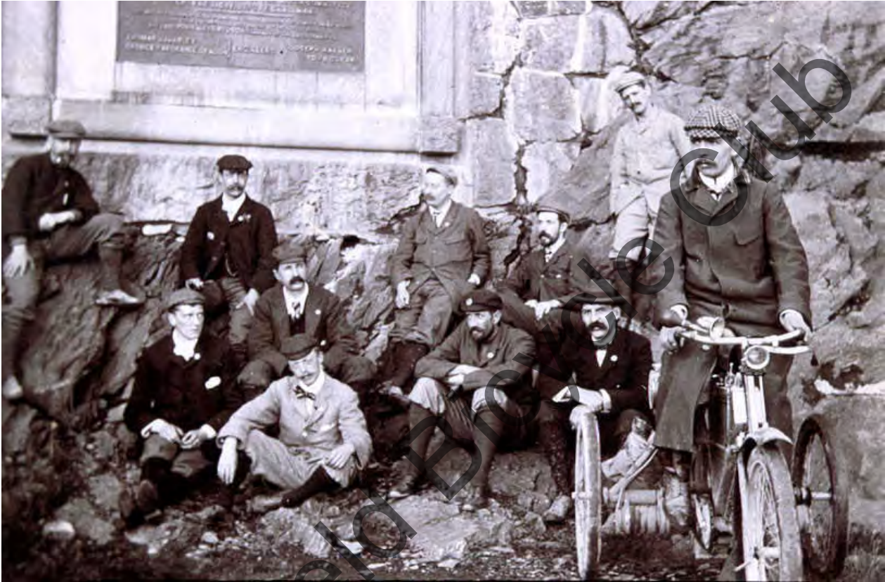
The Anfield Bicycle Club at Lake Vyrnwy 1900.

Autumn Tints 17 -19 October Cain Valley Hotel, Llanfyllin £30 B&B £15 for 3 course dinner on Saturday Final reminder £10 deposit please by 30 September to: Tecwyn Williams, 65 High Street FARNDON CH1 6PT